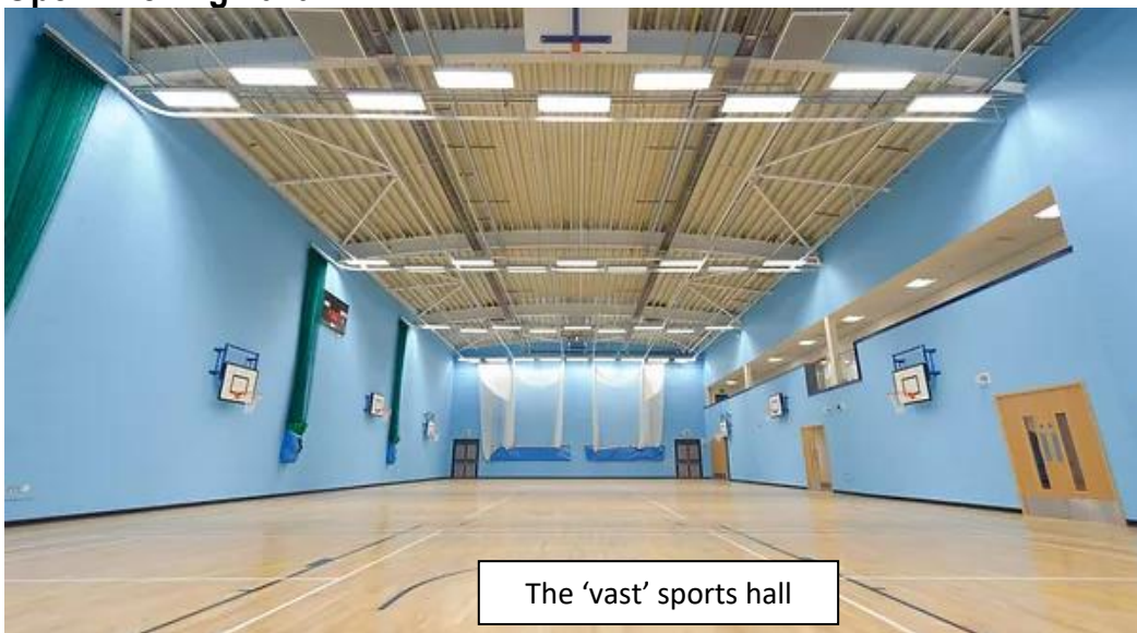
The 'vast' sports hall