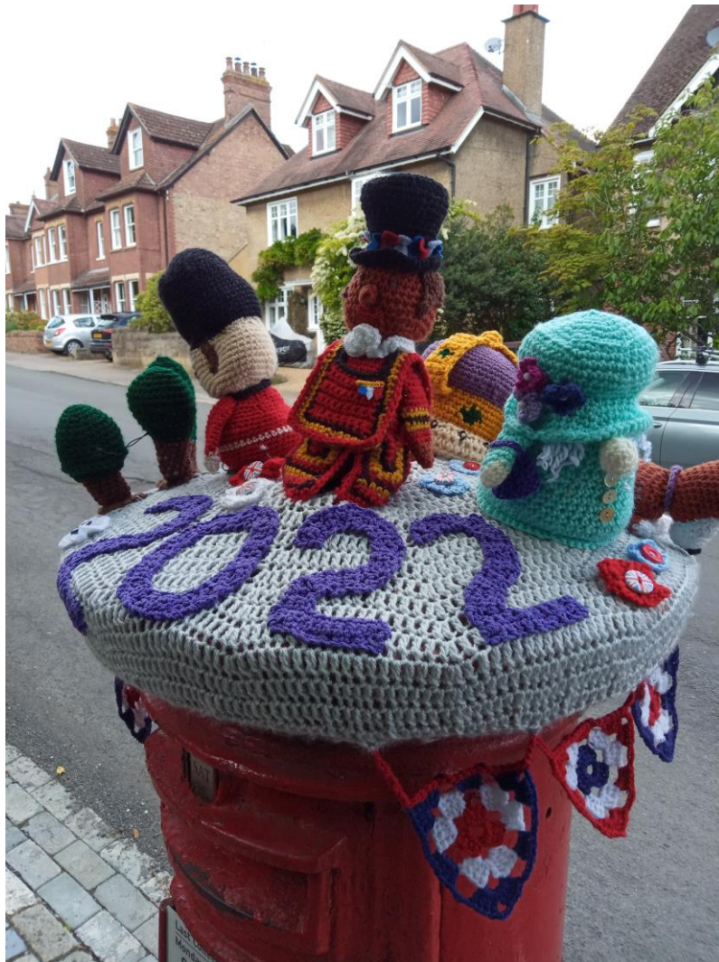
A Jubilee decorated post box in Harpenden.

Any comments/memories/photos ( GDPR?) of your time with us or your recent news will be greatly appreciated by all our readers.