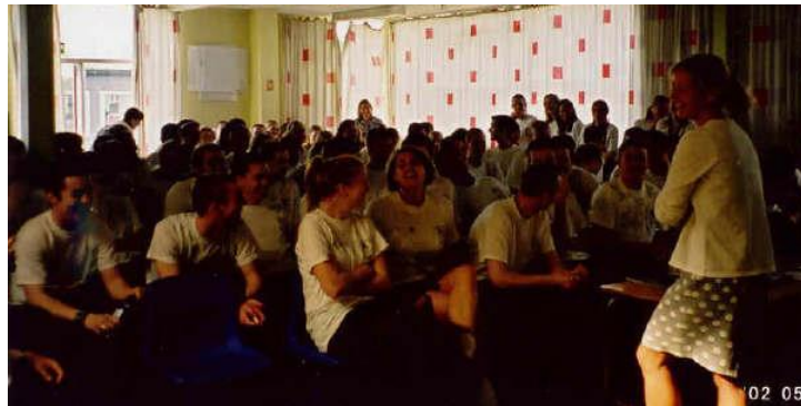
The last assembly