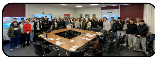
← Pen pals!